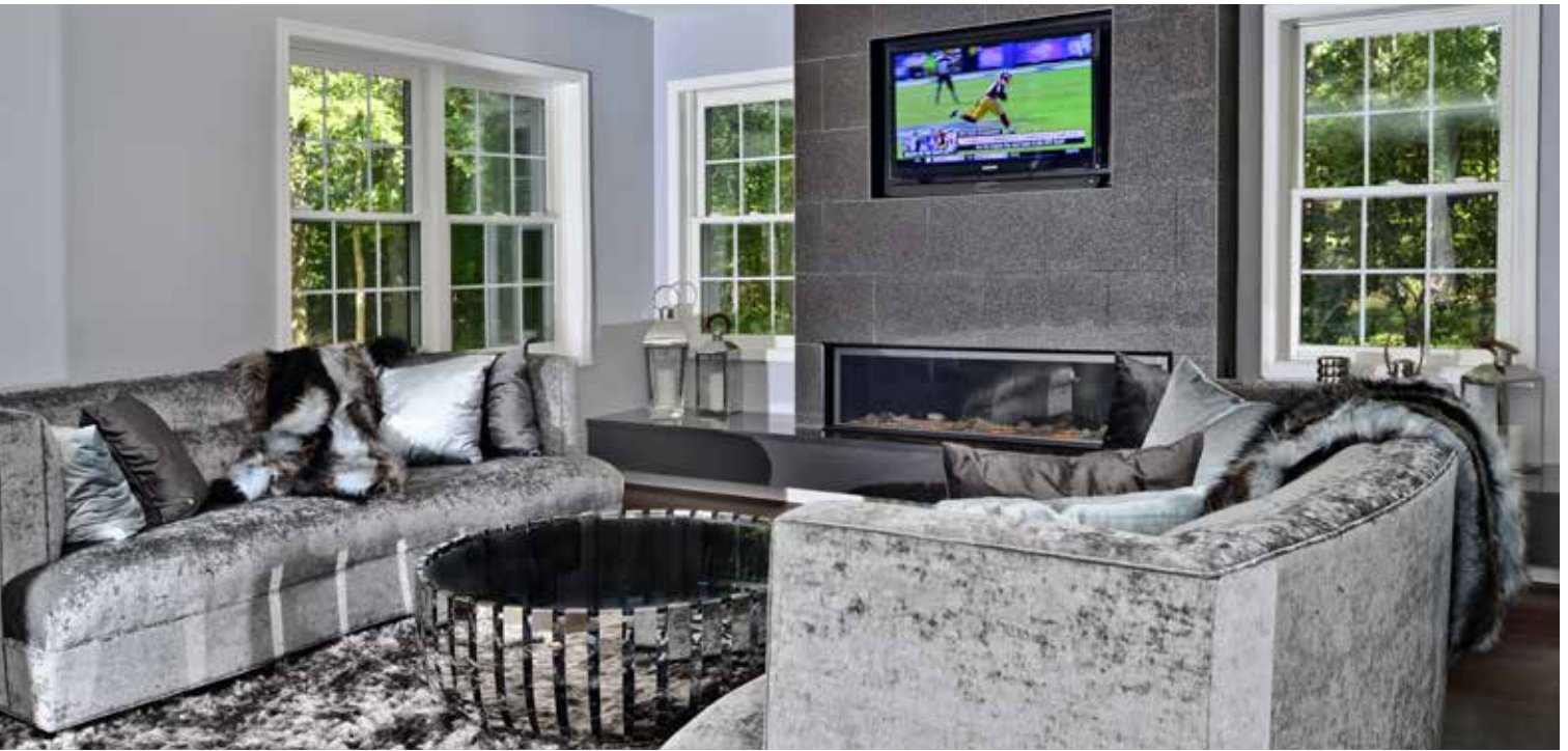
The comfortable seating area is well lit.