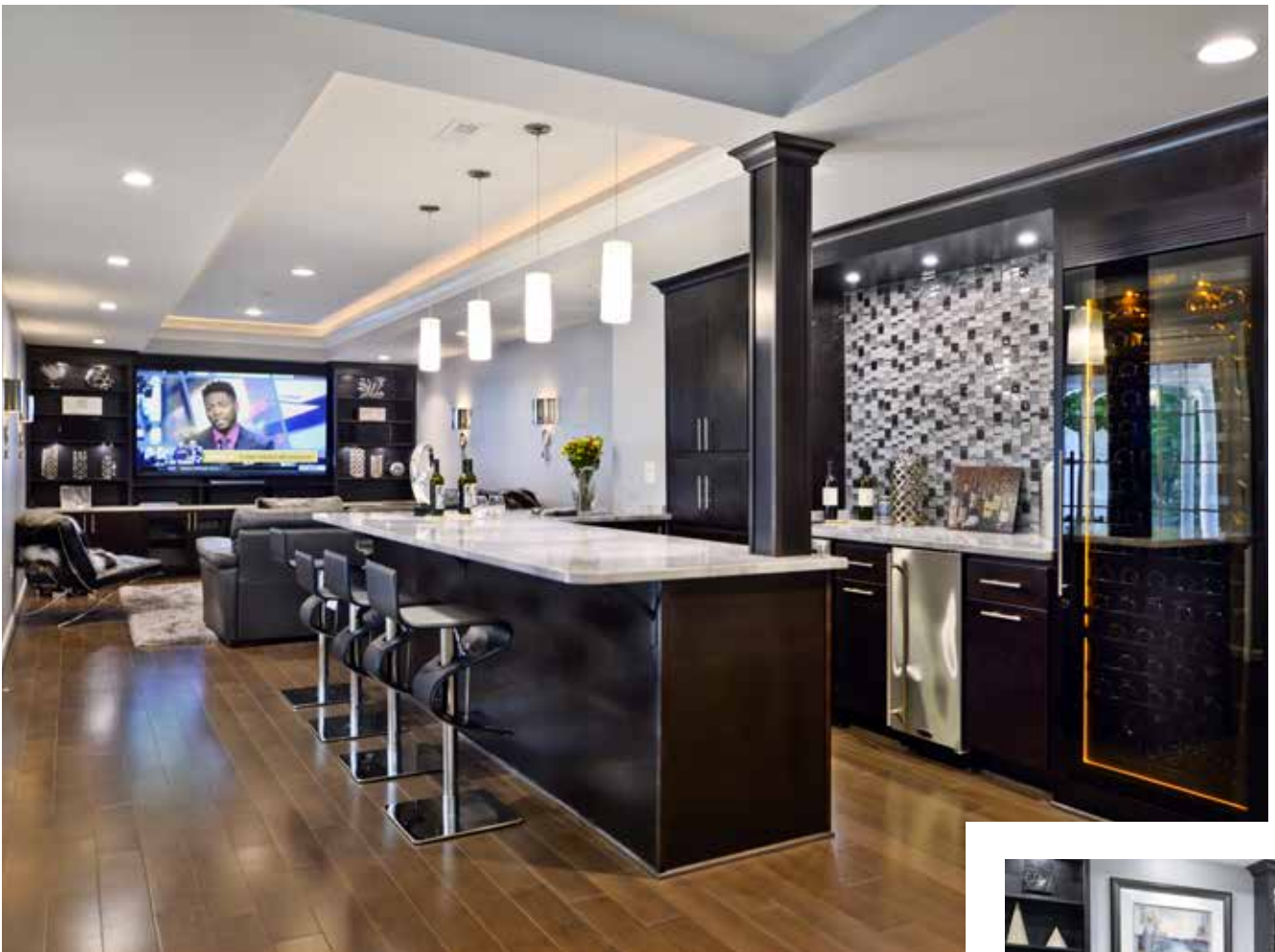
The open plan allows for a bar to connect to the theater area.

“THE VIVID COLOR TONES, STUNNING FIREPLACE WALL, AND MULTIPLE FURNISHED AREA SETTING HAS PUT THIS BASEMENT SPACE TO ITS MAXIMUM USE WITH GATHERINGS.” - SONNY NAZEMIAN, MCR, MCKBR