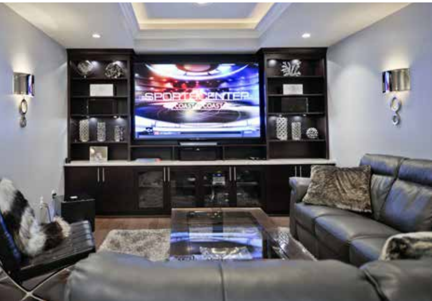
Watching TV is cozy.