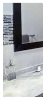
TOP: The bar offers seating and guests can roam. LEFT: The stylish bar is a great scene for entertaining. MIDDLE: We love a rain head shower. RIGHT: The new bathroom features great details.