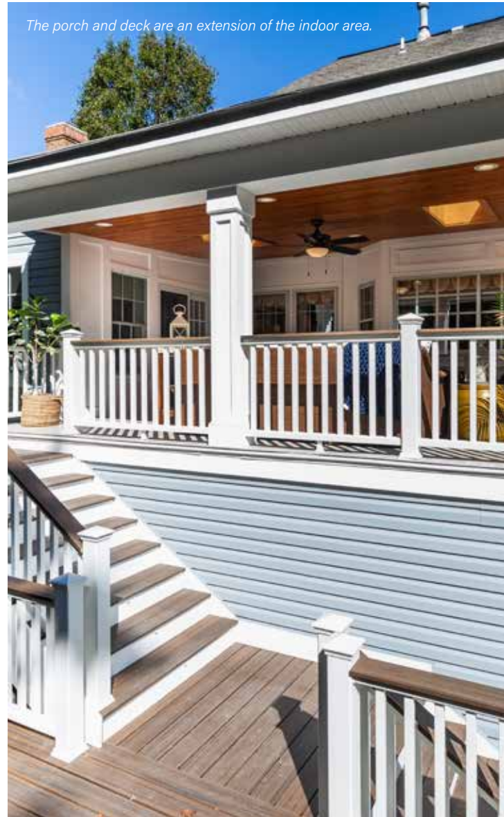
The porch and deck are an extension of the indoor area.

The team at Michael Nash worked to design a sunroom and covered porch with a multi-level deck and patio. The staff created a 16'x25' porch with cedar paneled ceiling and a linear gas fireplace with a large television above it on the stone chimney. Two large skylights and porcelain flooring keep the area bright and sunny and it is now the perfect spot to lounge and watch football games on chilly fall days. Large ceiling fans keep the area cool during the summer.