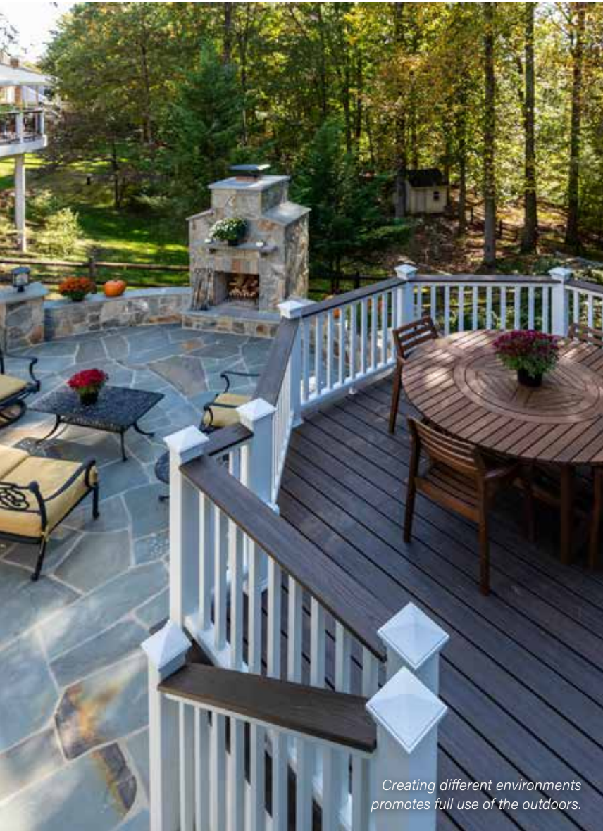
Creating different environments promotes full use of the outdoors.