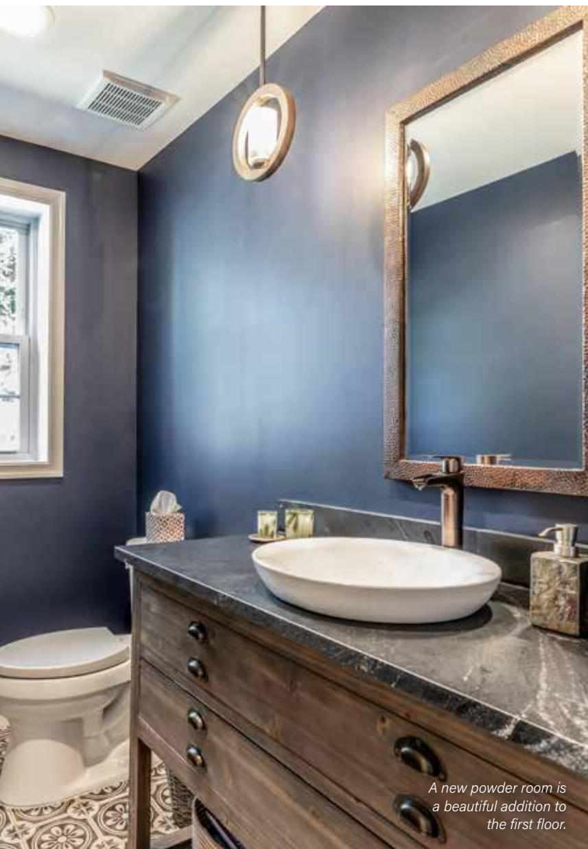
A new powder room is a beautiful addition to the first floor.