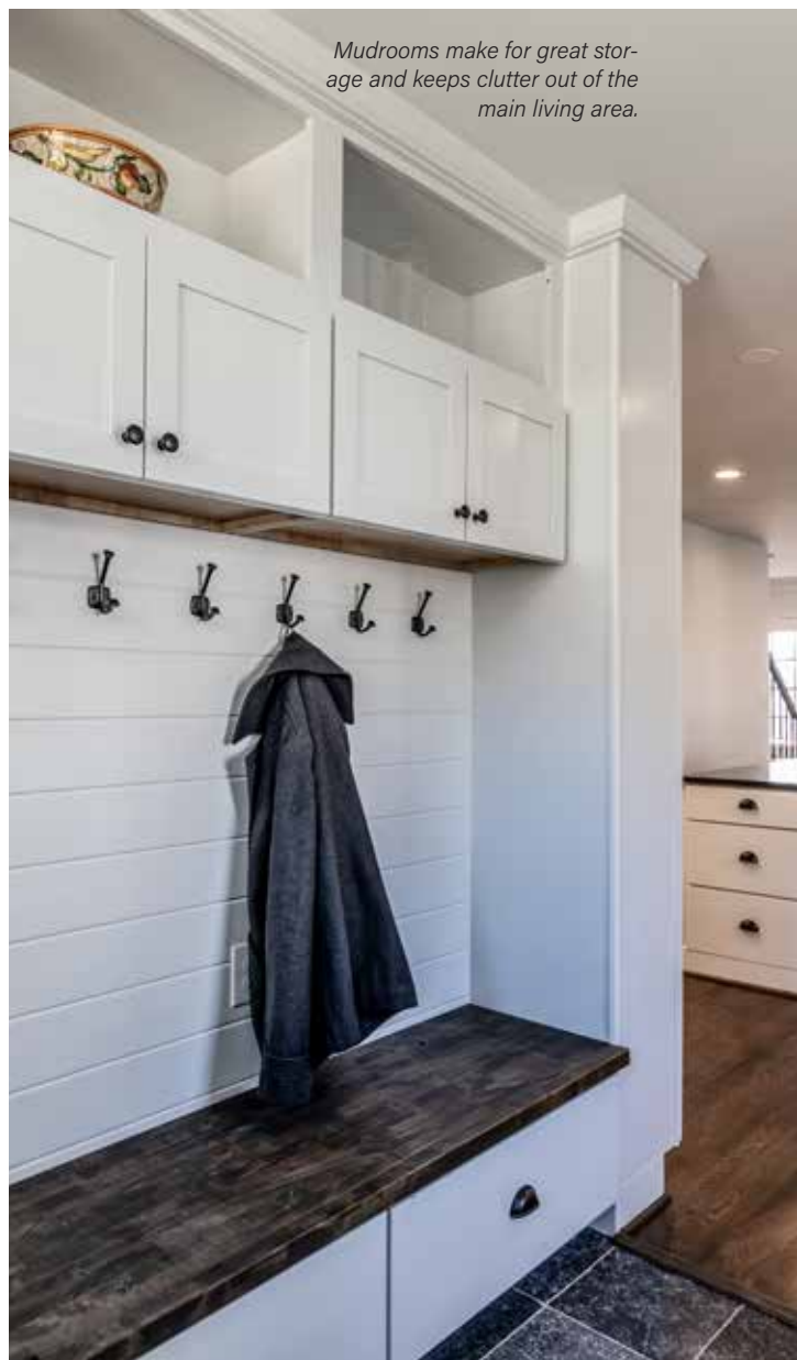
Mudrooms make for great storage and keeps clutter out of the main living area.

with tile floor, and a much-needed powder room, which was decorated with flowered-design floor tiles and a restored furniture-style vanity cabinet. Back windows were installed to bring even more light.