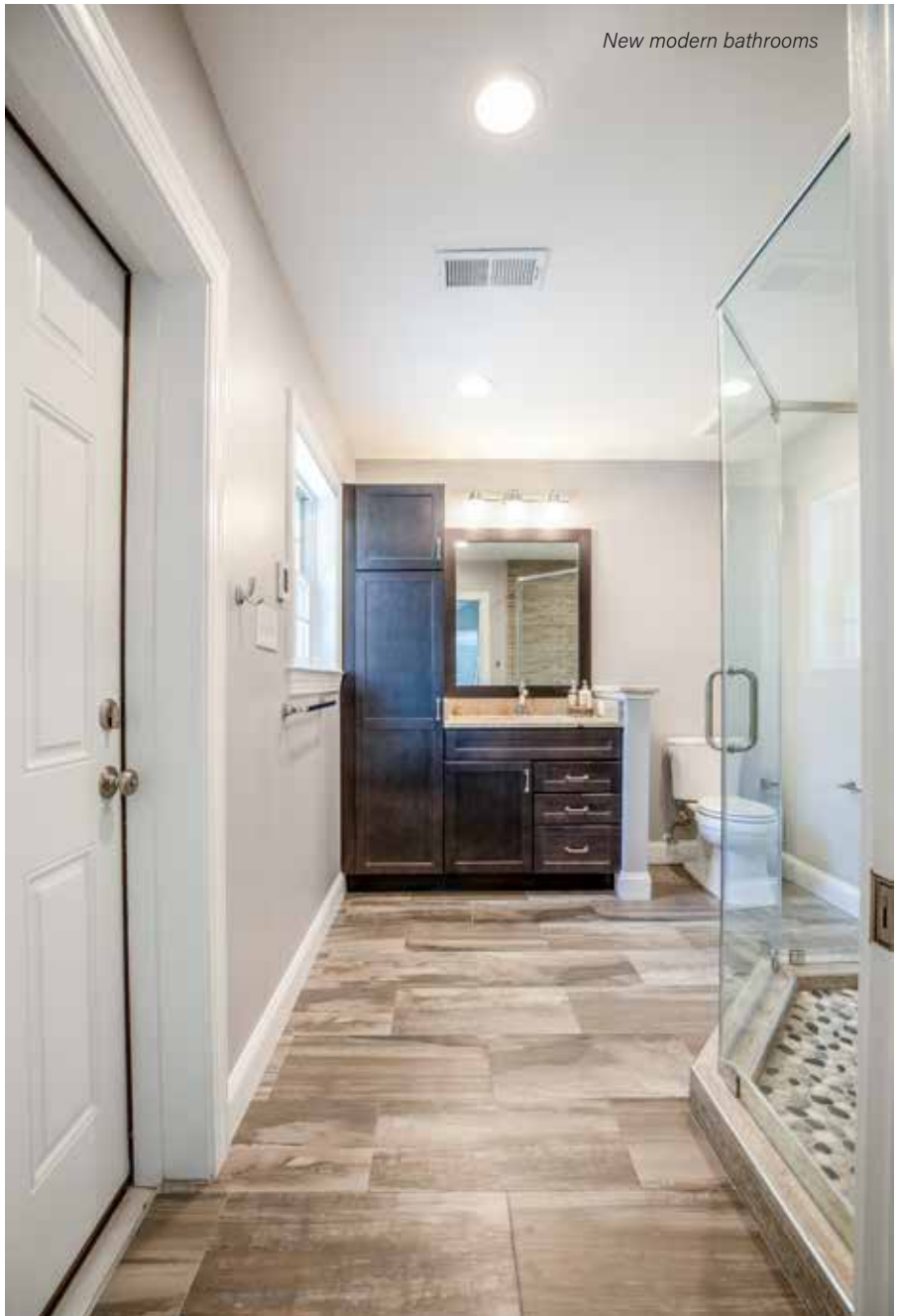
New modern bathrooms