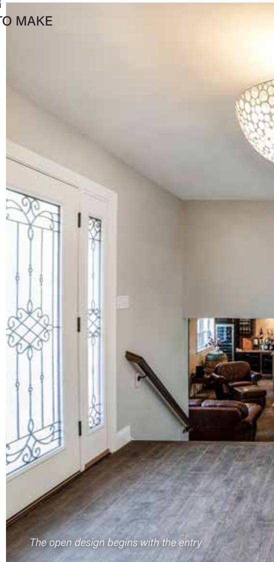
The open design begins with the entry