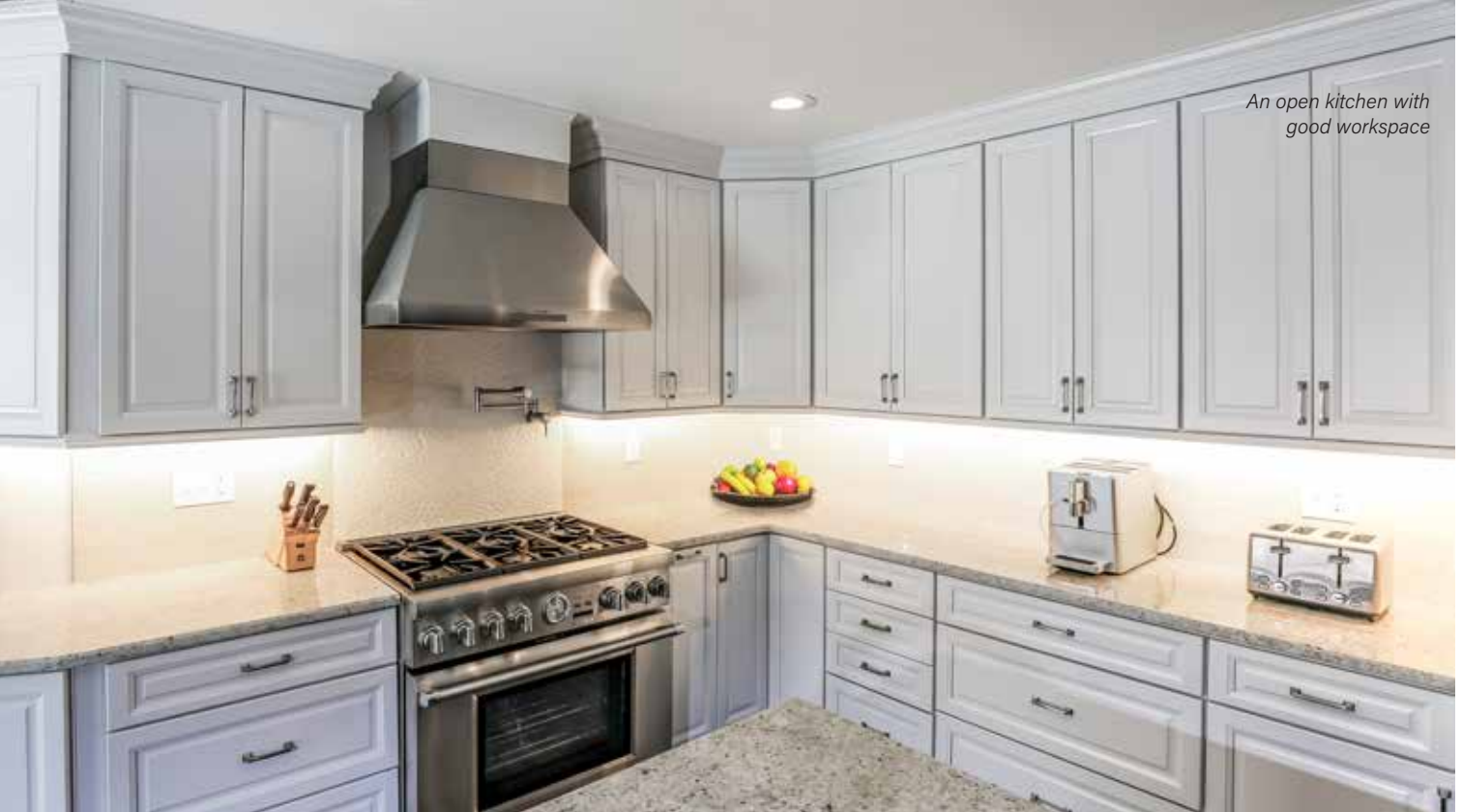
An open kitchen with good workspace