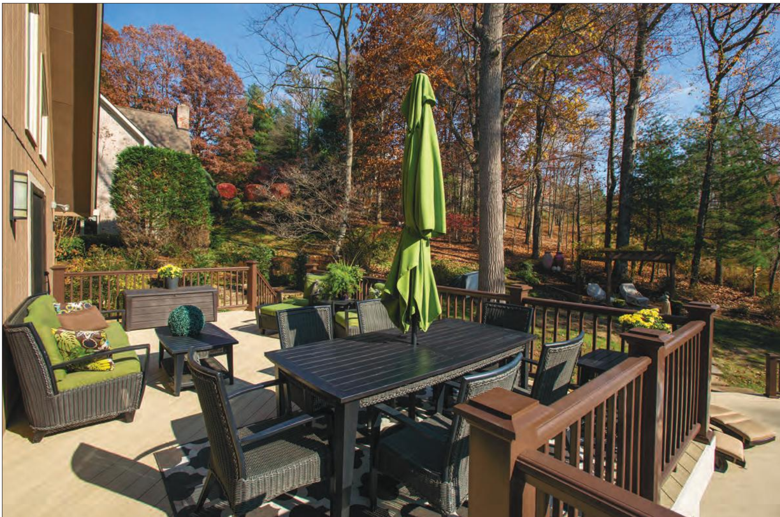
Page 44: A large circular sun deck is the focal point of the new backyard design.