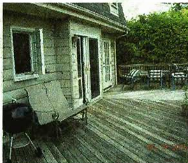
BEFORE: Lani and Norm Kass wanted more space for family in their McLean home.

The extensive renovation included updating the master bathroom, mud room, basement recreation room, secondary bath-